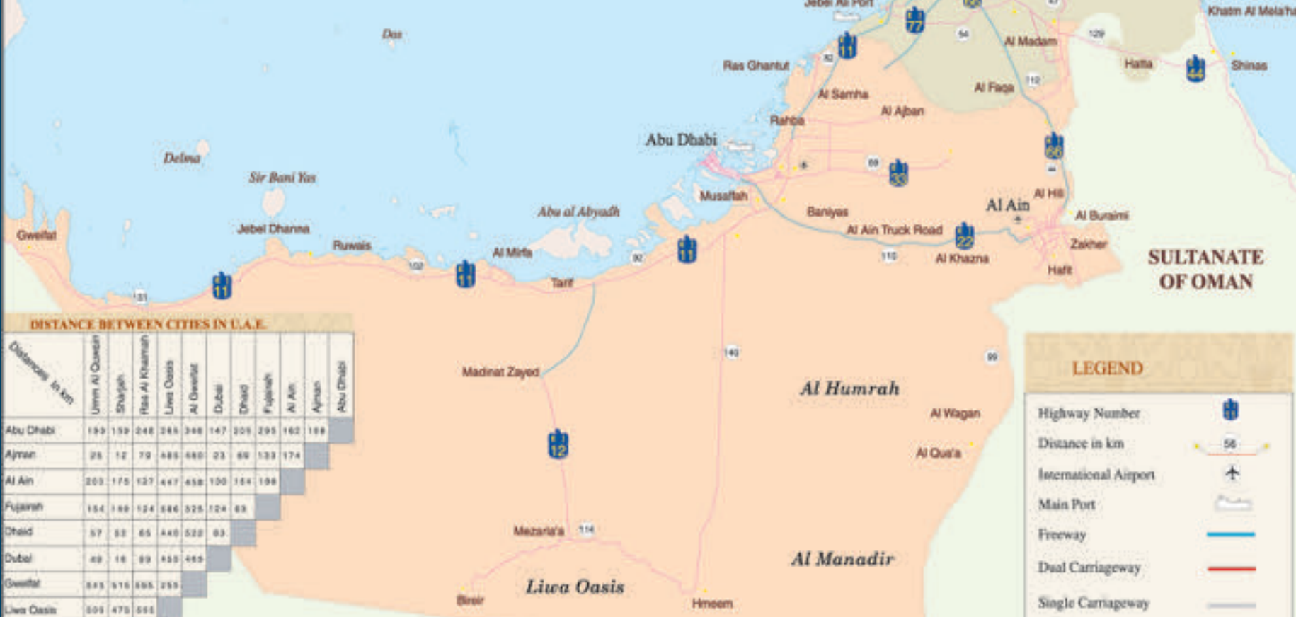
DISTANCE BETWEEN CITIES IN U.A.E.