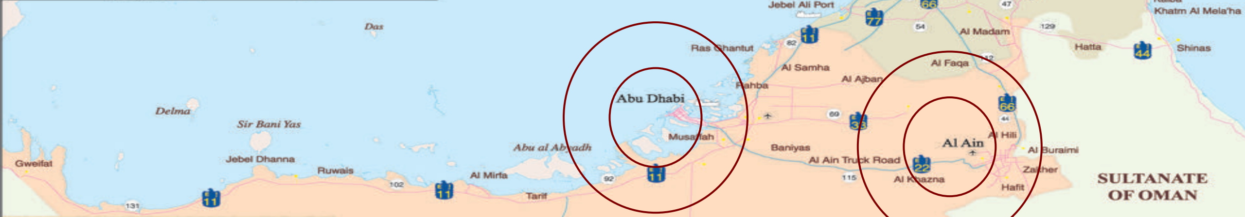
DISTANCE BETWEEN CITIES IN U.A.E.